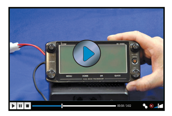
See the Digital Edition of QST for a video overview of the Icom ID-5100A dual band VHF/ UHF FM transceiver.

Manufacturer : Icom America, 12421 Willows Rd NE, Kirkland, WA 98034; tel 800-872-4266; fax: 425-454-1509; www. icomamerica.com.