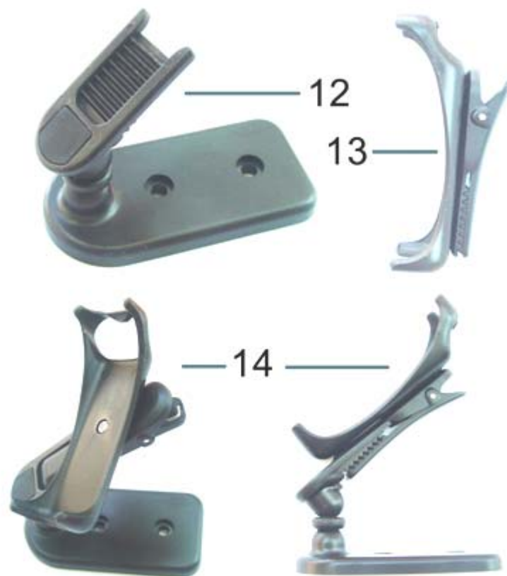
12: Foundation 13: Clip 14: Combination